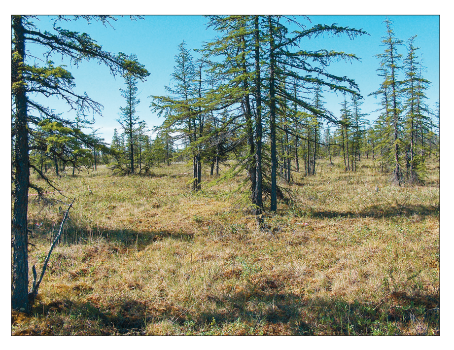
Fig. 3. Relatively healthy larch forest at the plate river terrace (Foto R. A. Ziganshin, 2008).

thick-needled pine may have it. In the locations of the dead forest it is clear that each tree has its own story of the death that is seen in the growth ring and crowns of trees. In one forest stand at the same time one can see not damaged, middle, hard damaged and dead trees of one species in the nearest