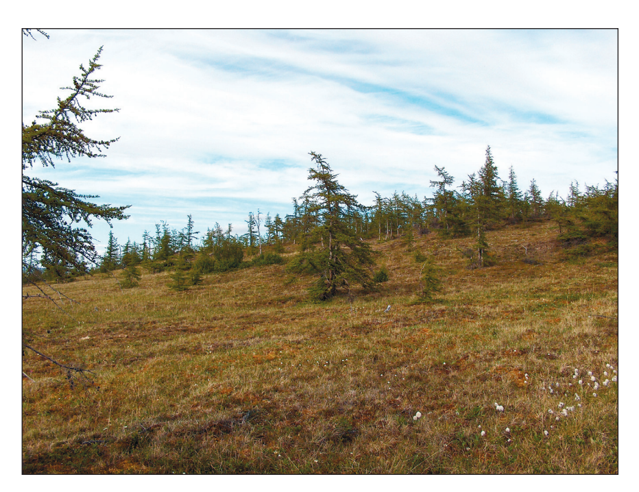
Fig. 2. Significantly damaged larch forest at the upper part of the slope (Foto R. A. Ziganshin, 2008).